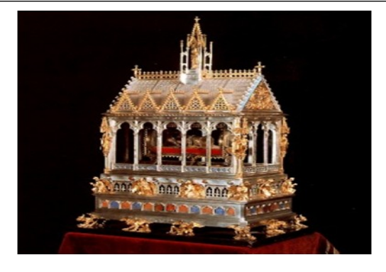
St. Stephen's mummified hand "The Holy Right"